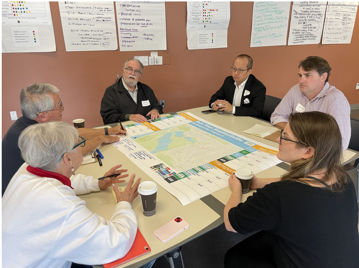
Neighborhood and City partners gathered at SF State for a Strategic Planning Meeting of Resilient Southwest San Francisco in October 2023.