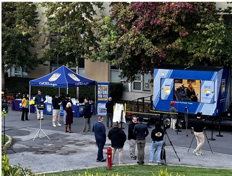
CalOES Shake Simulator getting set up on Centennial Way early morning on October 12, 2023.

On October 12, 2023, the California Governor's Office of Emergency Services (CalOES) brought a Shake Simulator to campus as one stop on a statewide education tour. There were 310 Shake Simulator Riders in 110 Shake Simulator Experiences. The event was covered by local San Francisco television media: KGO (ABC), KNTV (NBC), KPIX (CBS), KTVU (FOX), KRON, KDTV (Univision 14), and KSTS (Telemundo 14). CBS Radio and the Golden Gate Express also covered the event.